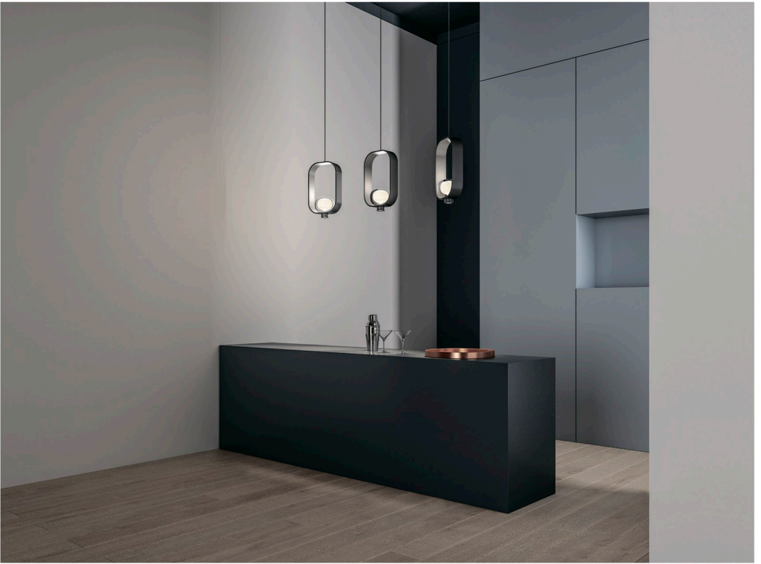
FILIPA 555.22 / sand black + sand grey + clear glass