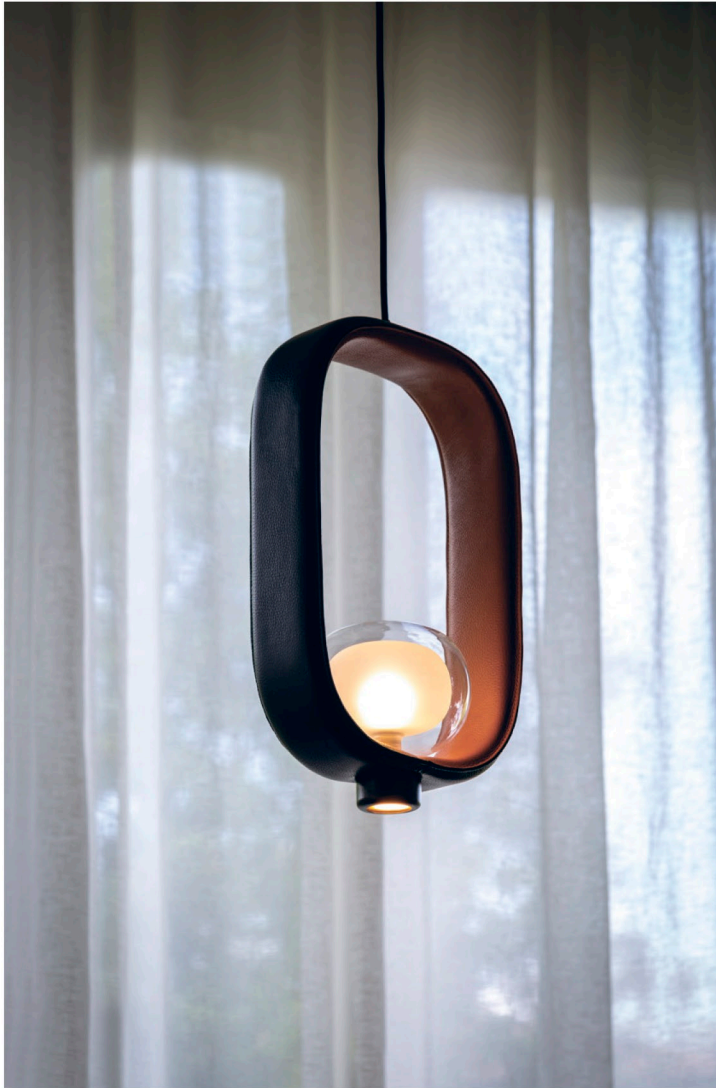
FILIPA 555.22 / sand black + blu/brown leather + clear glass