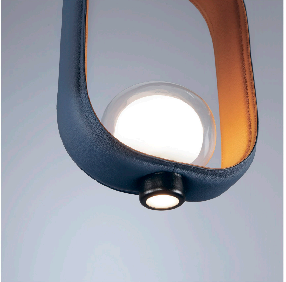
FILIPA 555.22 / sand black + blu/brown leather + clear glass