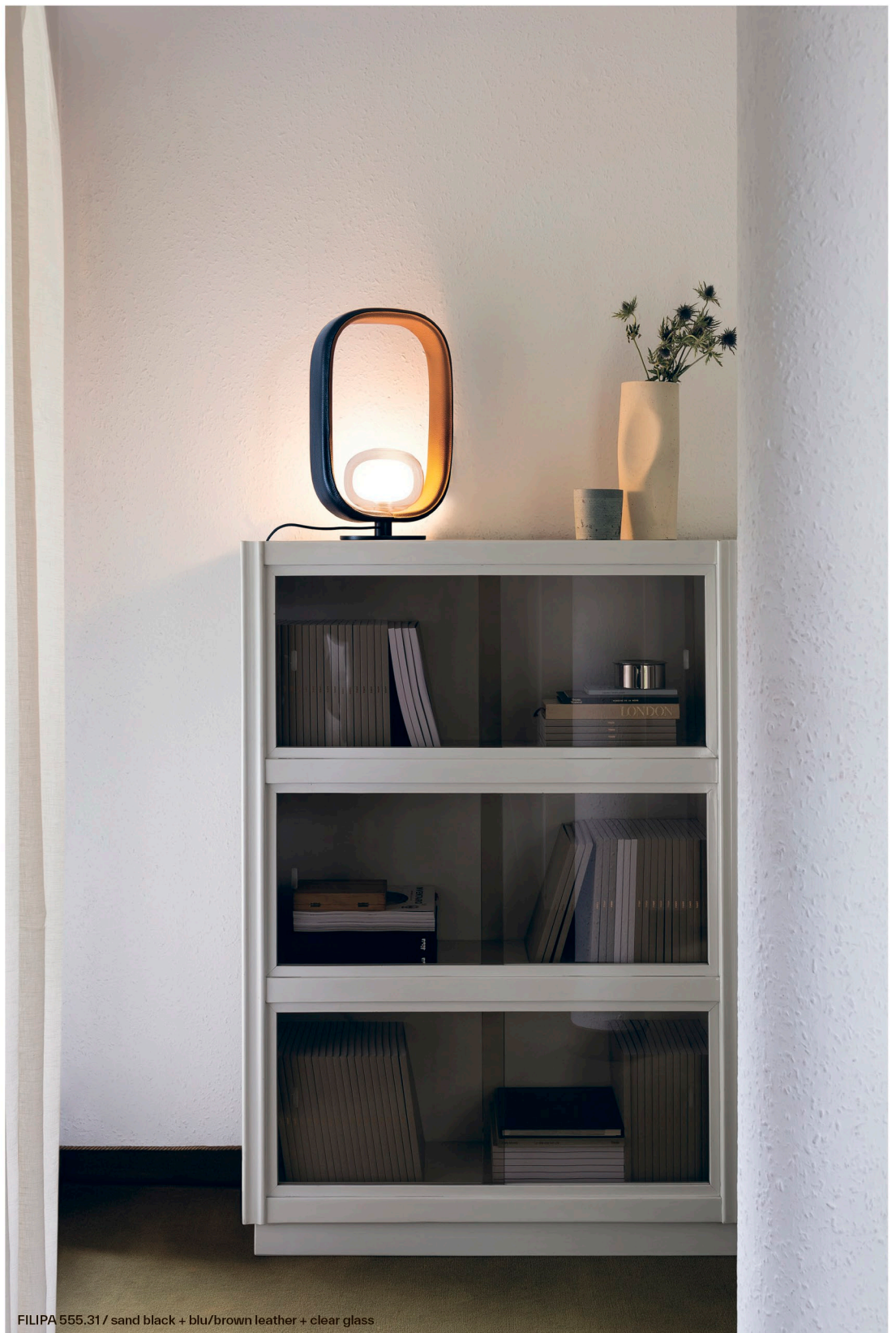
FILIPA 555.31 / sand black + blu/brown leather + clear glass