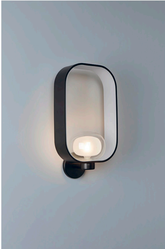
FILIPA 555.41 / sand black + sand grey + clear glass