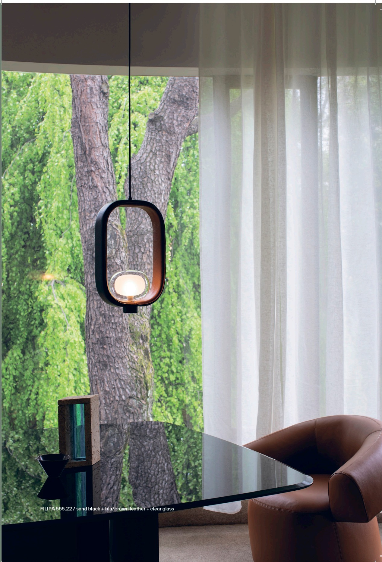
FILIPA 555.22 / sand black + blu/brown leather + clear glass